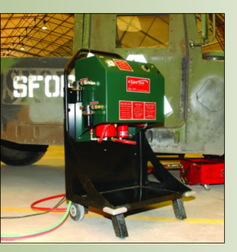
This oil-blending device is used to collect the used oil from the vehicle, draw fuel from the vehicle's fuel tank and blend the two. Once the vehicle's fuel and used oil are blended, the mixture is returned to the fuel tank to run the vehicle, saving the need to dispose of the oil.

The oil and fuel blending system consists of a drain pan for collecting the waste oil and a pump and