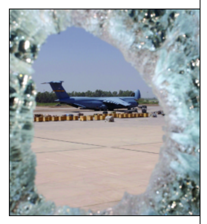
A C-5A Galaxy is viewed through a hole in a window at Baghdad International Airport. The transport aircraft deployed to Iraq from Dover Air Force Base, Delaware, to support Operation Iraqi Freedom.

The Department of Defense's (DOD's) first technology demonstration of Auto-ID at the Defense