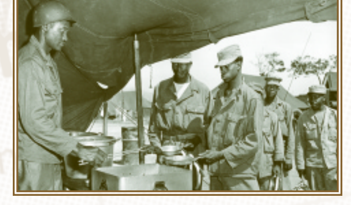
Steak is served to the 43d Transportation Truck Company in Uijongbu in 1951.

The lack of U.S. military readiness received con-