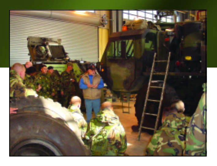
A 2ID LAR instructs Army personnel on the operation and maintenance of the heavy, expanded-mobility tactical truck.

LARs teach many classes throughout the year on a variety of subjects, but three training programs stand out above the rest. They are the School of the HEMTT [heavy, expanded-mobility tactical truck], Mobile STAMIS [Standard Army Management Information