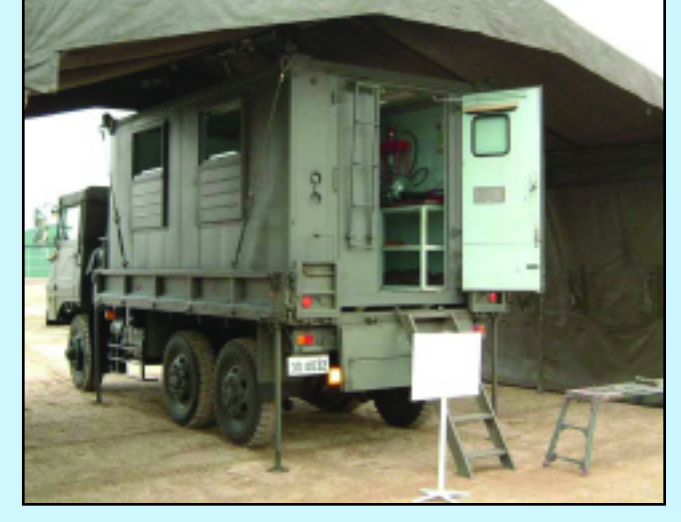
In a field environment, repair parts are made in this type-73 truck-mounted mobile parts fabrication shelter.

Cooperation Law in 1992, Japan began providing support to international disaster relief, humanitarian aid, and United Nations (UN) peacekeeping operations. The JGSDF has dispatched engineer, logistics, and medical contingents in support of international relief and UN efforts around the world, including those in Cambodia, Mozambique, Zaire, and Honduras.