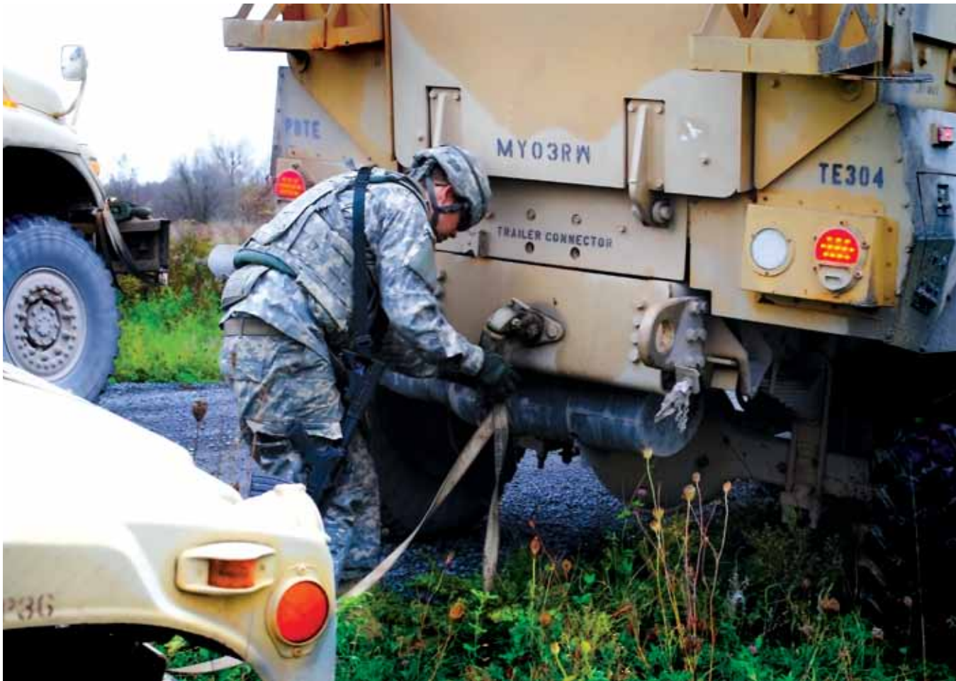
514th Support Maintenance Company Soldiers practice recovery operations at the Joint Readiness Training Center in August 2011.

The JRTC rotation should also serve as a training event exercising sustainment brigade support functions. An ideal arrangement is to have a sustainment brigade exercising mission command over the CSSB's supporting maneuver and advisory forces during the rotation. The challenge will be to align multicomponent EAB logistics units with deployment and availability timelines. As this concept evolves, it is imperative to start scheduling EAB units on the CTC patch chart. (A patch chart is a tentative schedule of when units will attend training.)